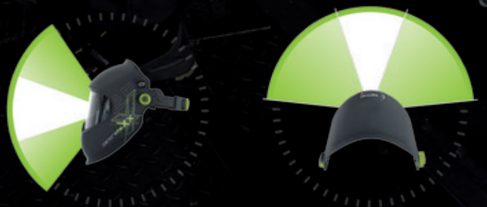
Comparing fields of view: standard ADF vs. optrel panoramaxx